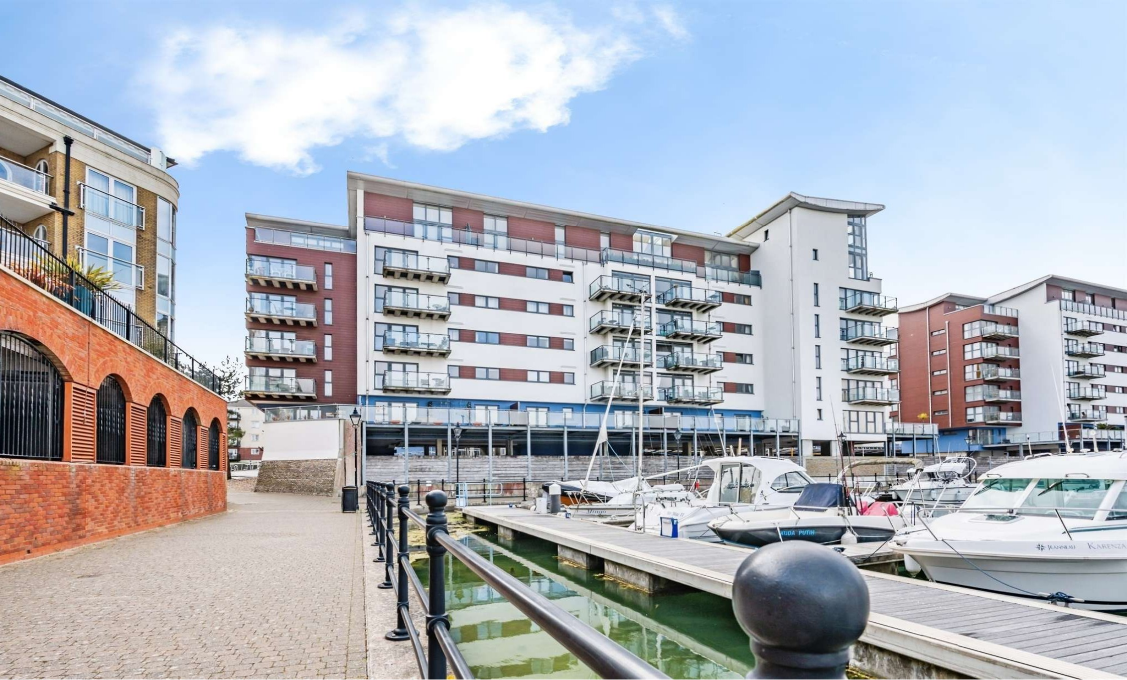
Rapala Court Midway Quay, Eastbourne BN23 5DB