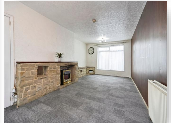
Bedford Gardens, Leeds LS16 6DH