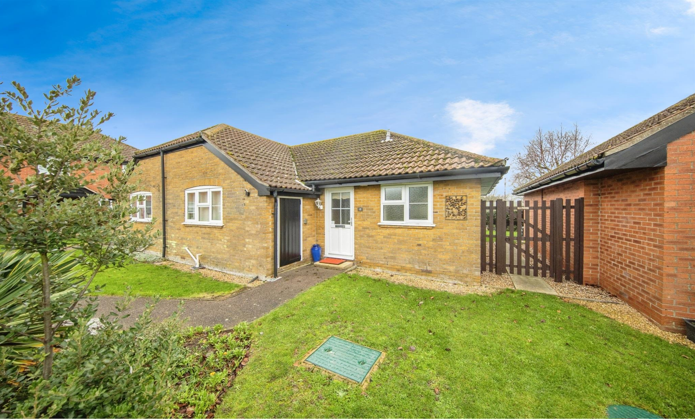
Rosery Mews, Great Holland Frinton-On-Sea CO13 0SG