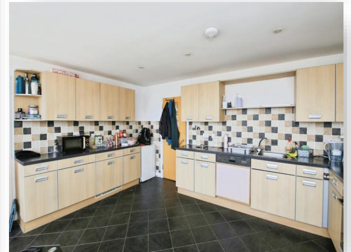
The Apex Oundle Road, Peterborough PE2 8AT