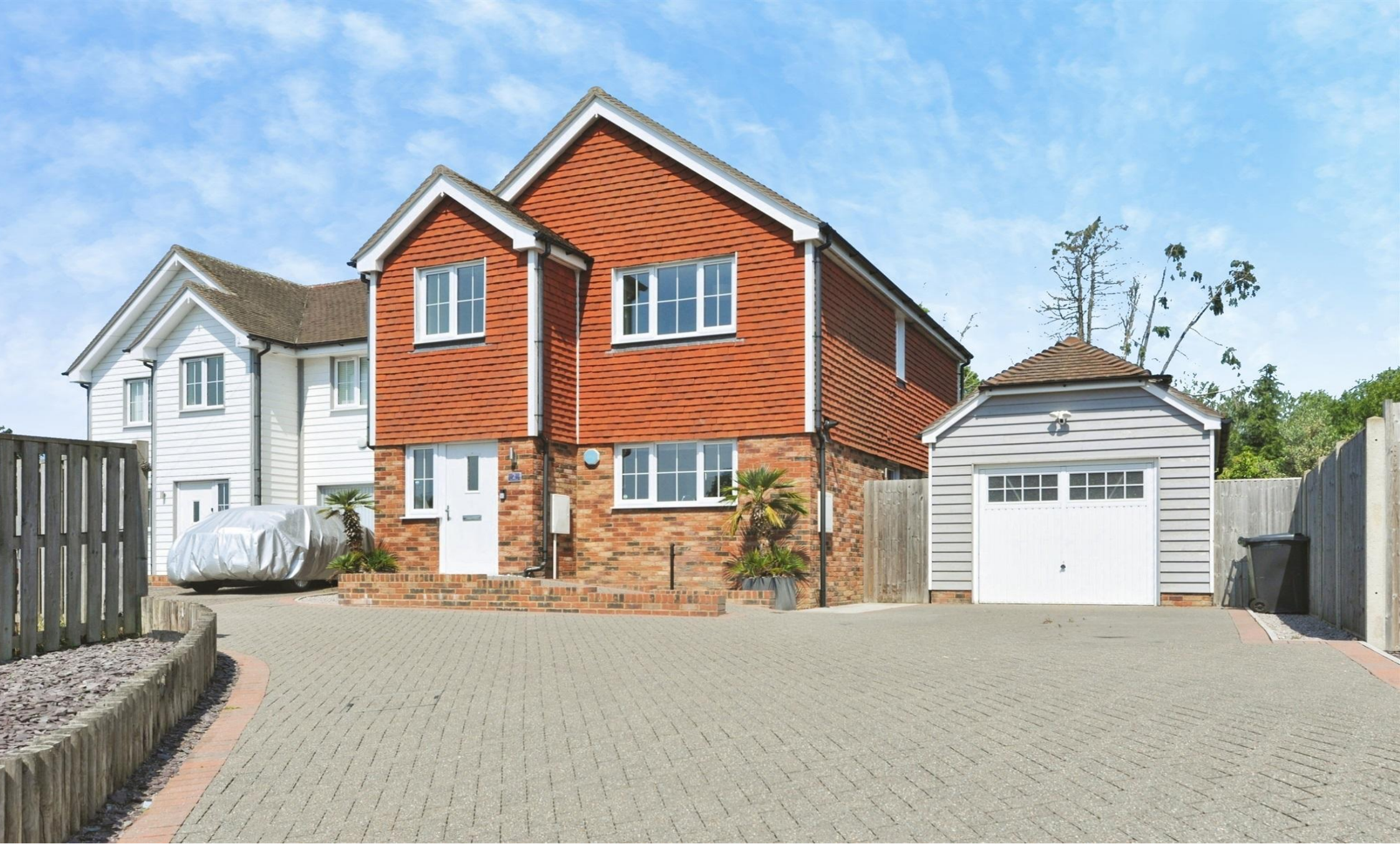
Lea Close, Brede - Rye TN31 6FW