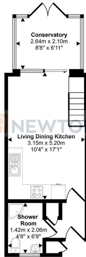
Ground Floor Approx 28 sq m / 305 sq ft

Approx Gross Internal Area 46 sq m / 491 sq ft