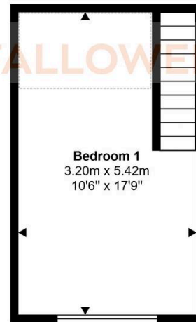
First Floor Approx 17 sq m / 186 sq ft