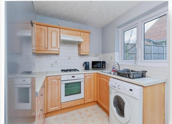
Cloverdale Road, Hamilton Leicester LE5 1UL