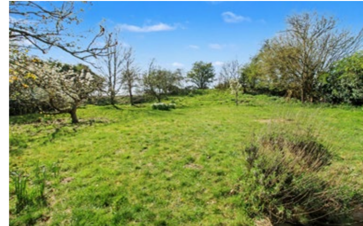
Garden opposite the property

“A rare and welcome bonus, the property enjoys both private courtyard seating space and a separate orchard area, adding a sense of openness and greenery.”