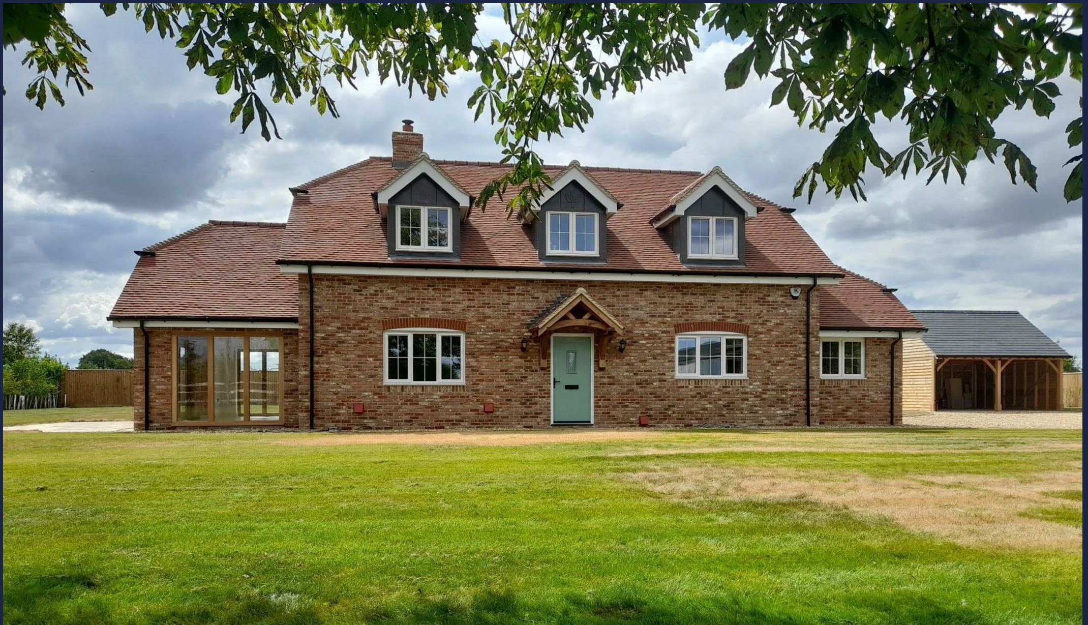
The Old Coach Works, Salisbury Road, Andover