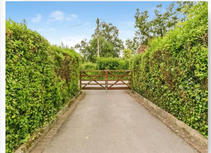
Hawthorne Cottage, School Lane, Leigh, Stoke-On-Trent. ST10 4SS