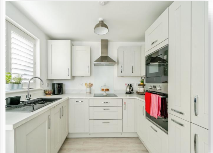
Baler Grove, Pagham PO21 3FS