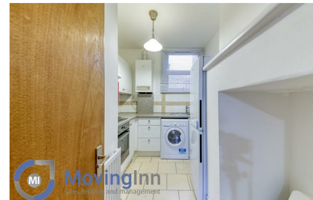
Ground Floor 281 sq.ft. (26.1 sq.m.) approx.