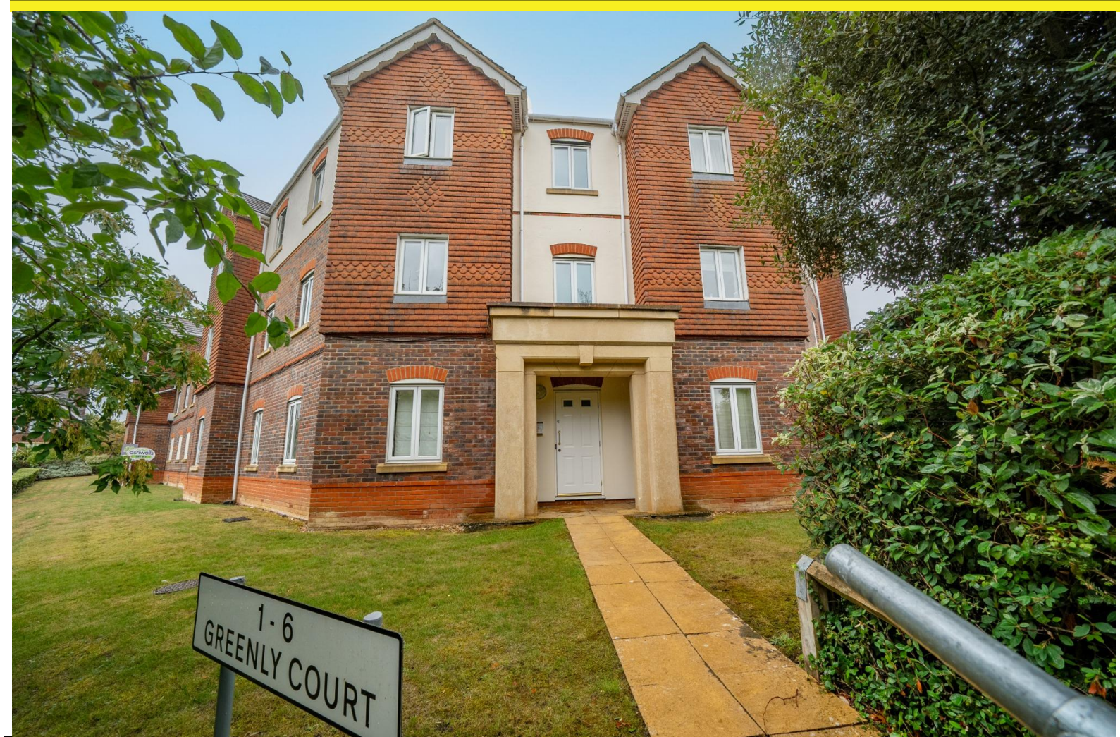
Greenly Court, Andover