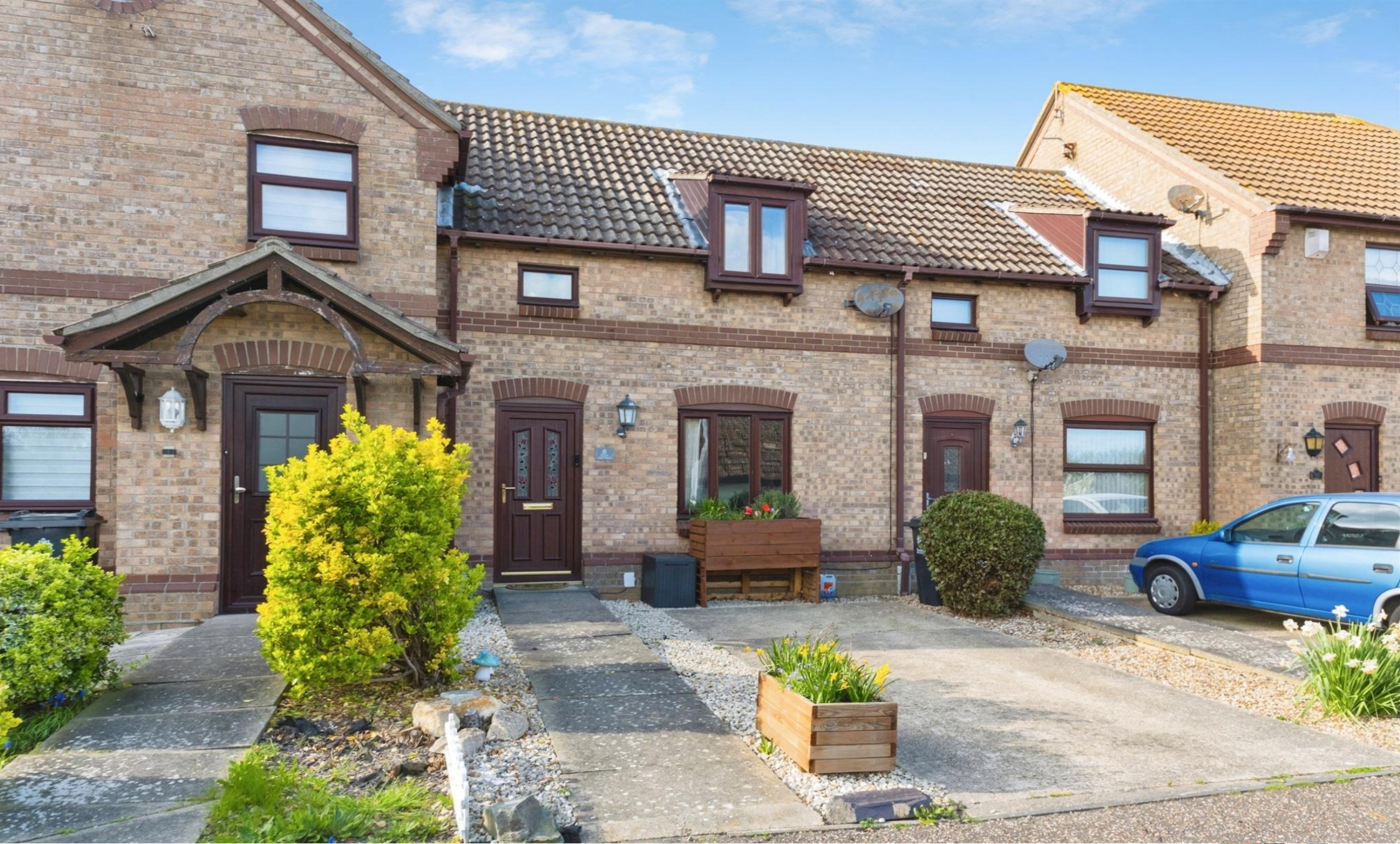
The Larneys, Kirby Cross Frinton-On-Sea CO13 0UG