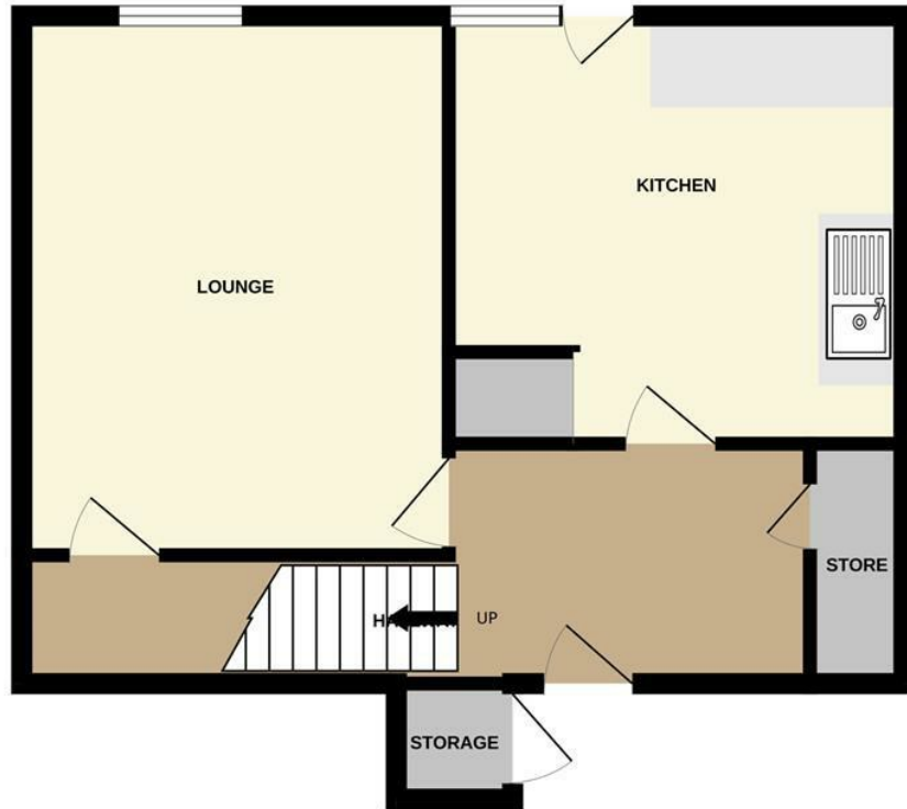
GROUND FLOOR 469 sq.ft. (43.6 sq.m.) approx.