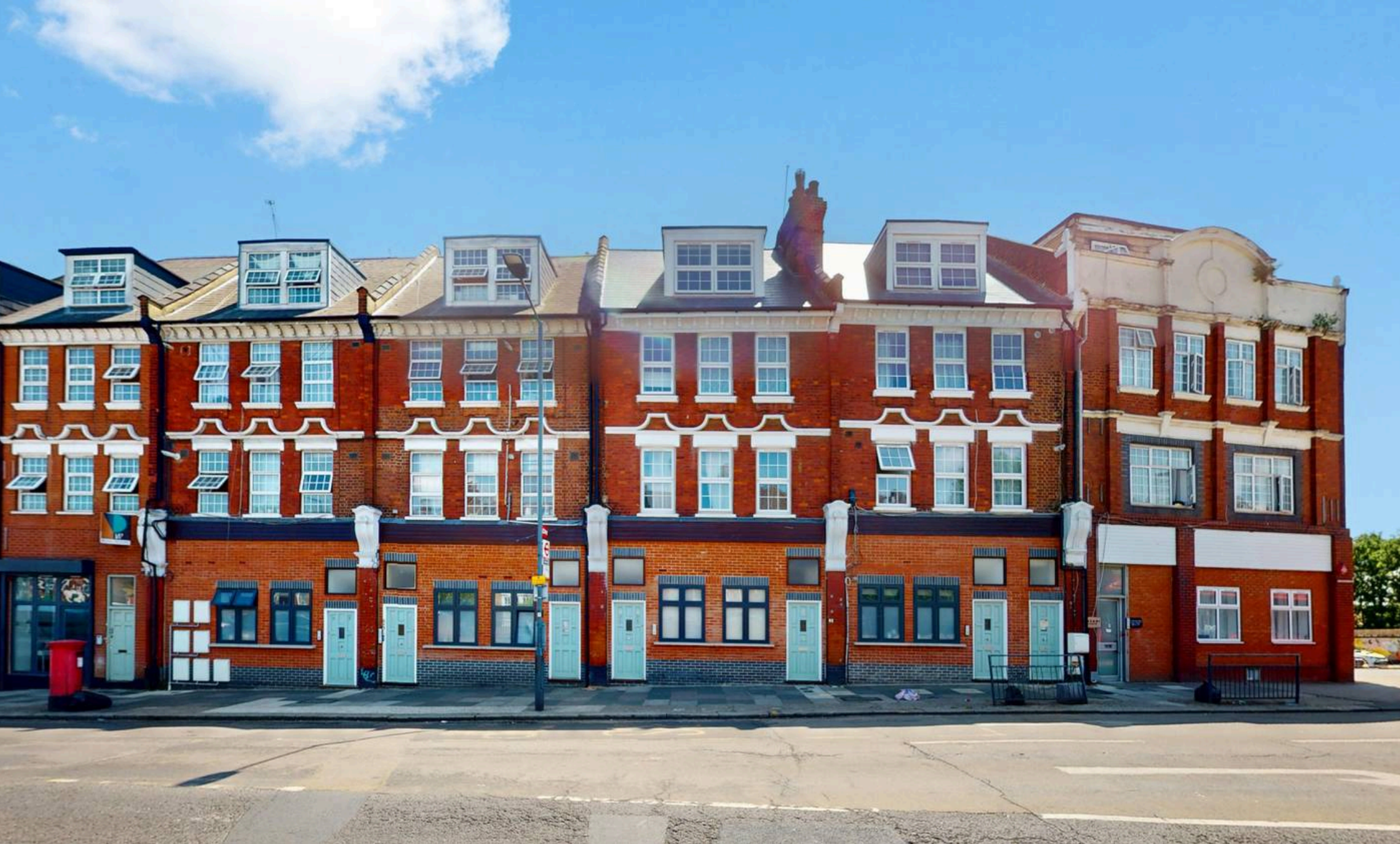
Burnley Road, Dollis Hill, NW10 £1,850 pcm