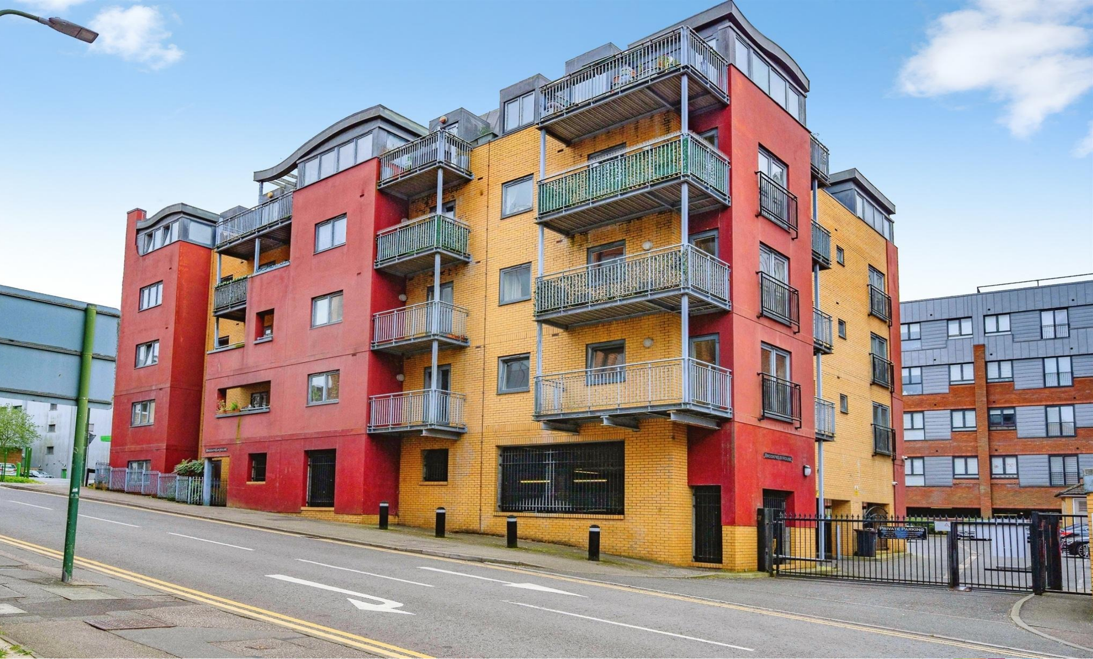
Brookfield House Selden Hill,HEMEL HEMPSTEAD HP2 4FA