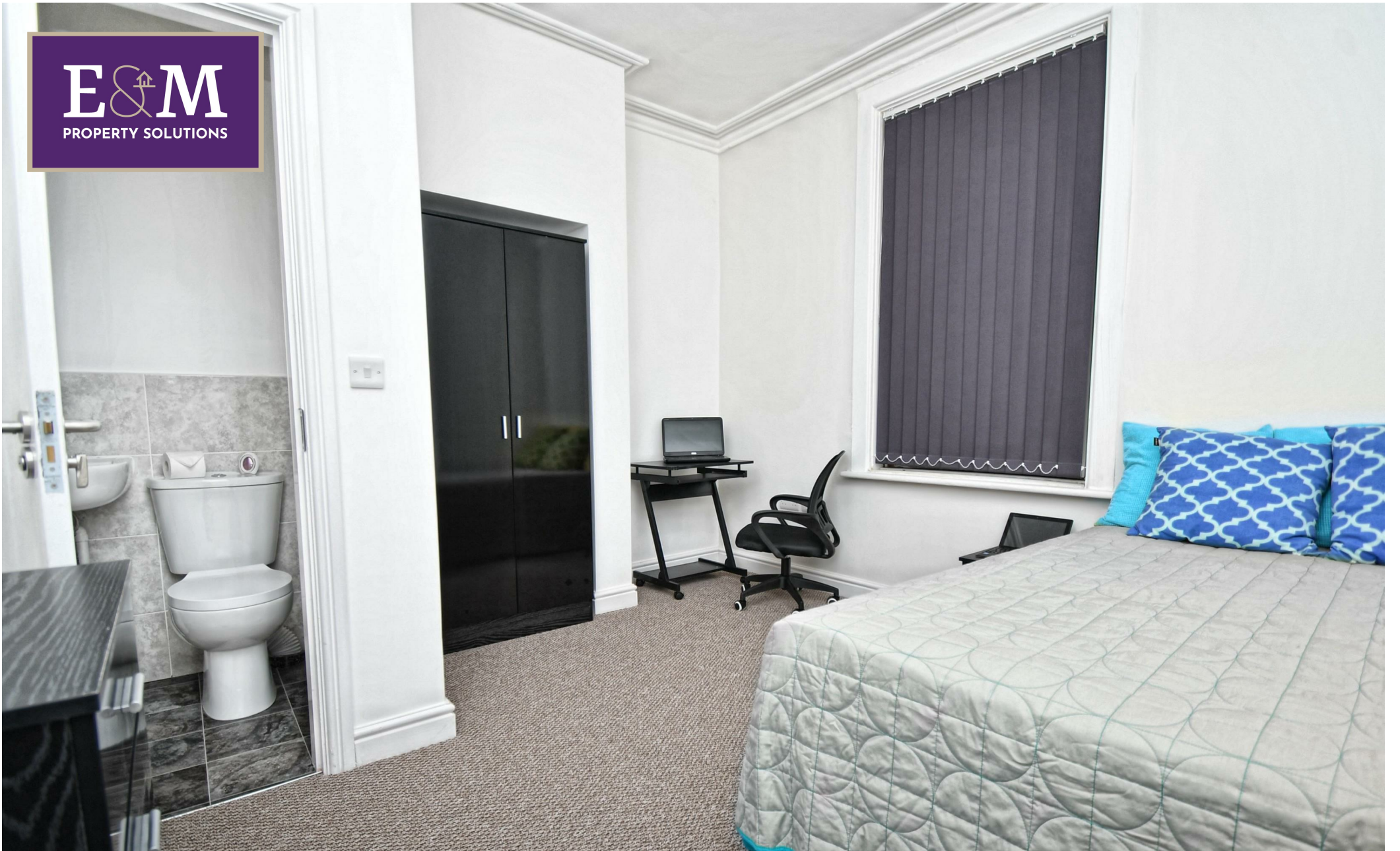
Room 1, 27 Deepdale Road, Preston, Lancashire, PR1 5AP £120 Per week