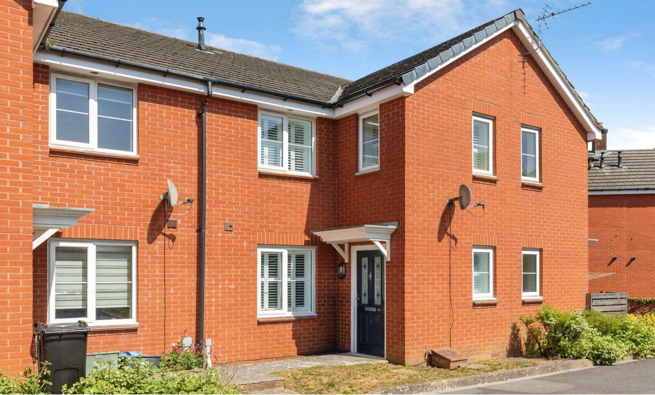
Eden Grove, Bristol BS7 0PW