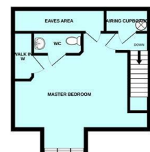
Made with Mergys ©2026