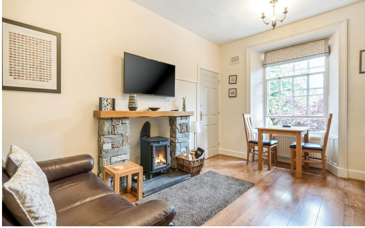
Sitting/ Dining Area