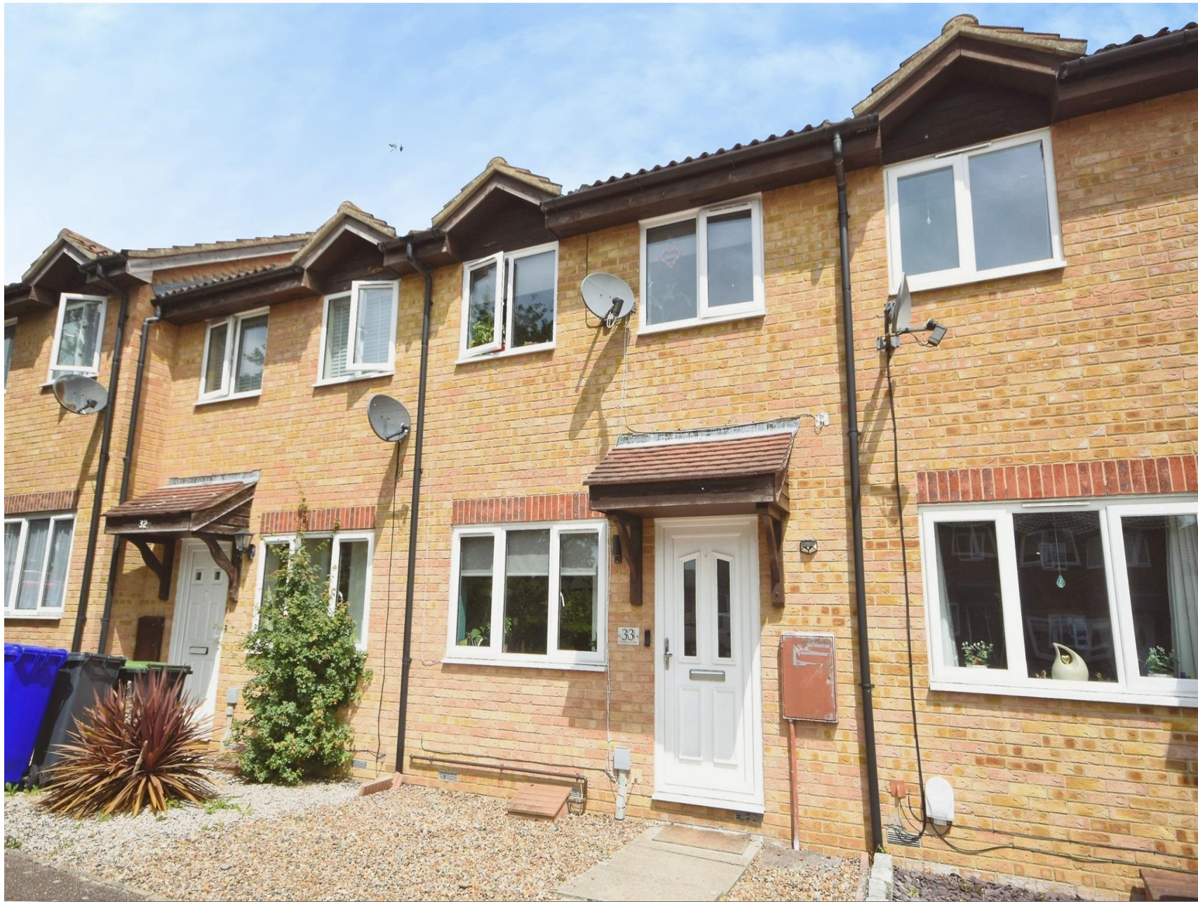
Stockley Close, Haverhill, CB9 0NB