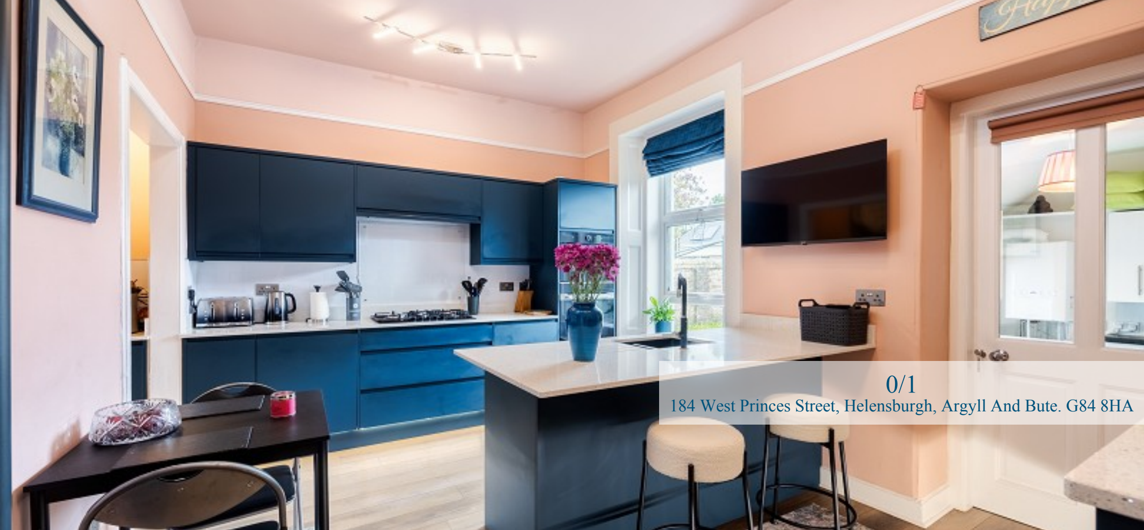
0/1 184 West Princes Street, Helensburgh, Argyll And Bute. G84 8HA