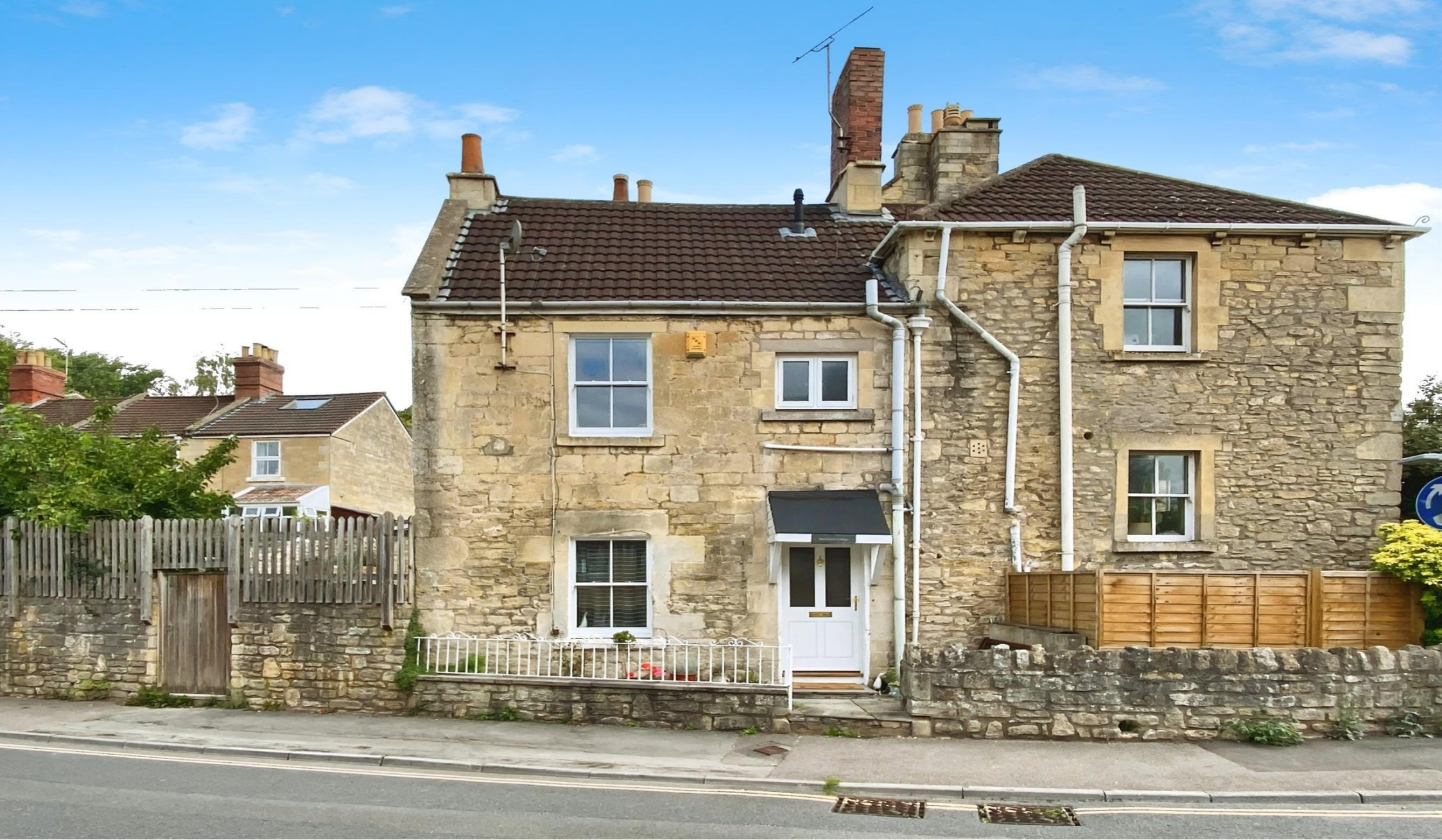
Stambrook Cottage, Stambridge, Bath, BA1 7NH