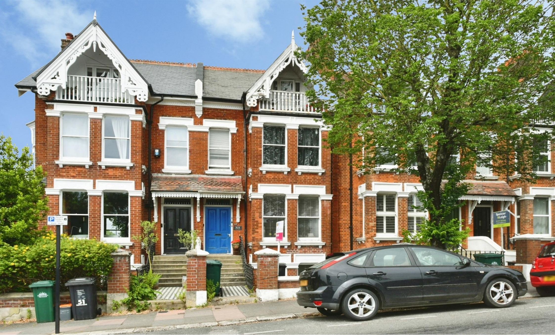
Preston Drive, Brighton, BN1 6LA