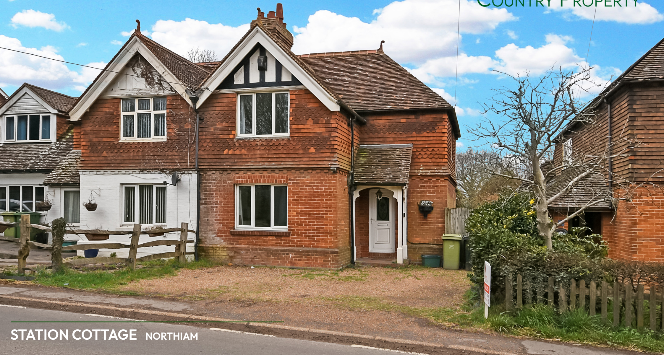
STATION COTTAGE NORTHIAM