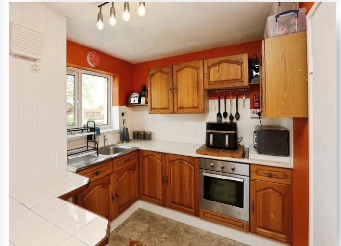
Mandarin Way, Gosport PO13 8EL