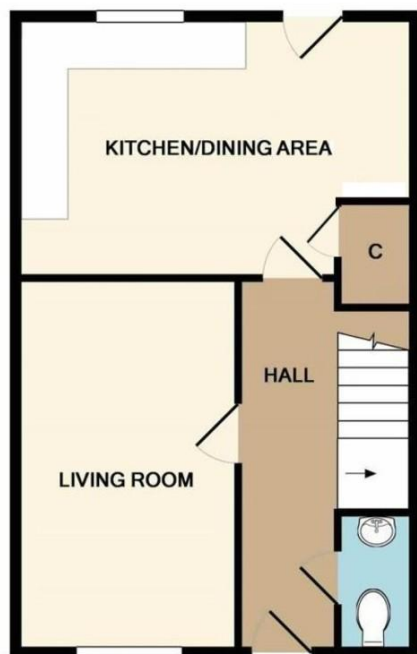
GROUND FLOOR APPROX. FLOOR AREA 452 SQ.FT. (42.0 SQ.M.)