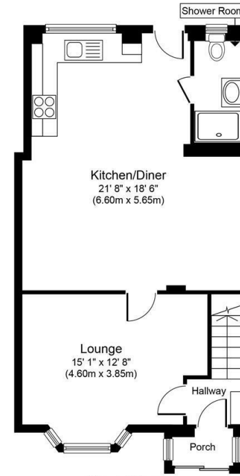
Ground Floor Approximate Floor Area 615 sq. ft. (57.1 sq. m.)