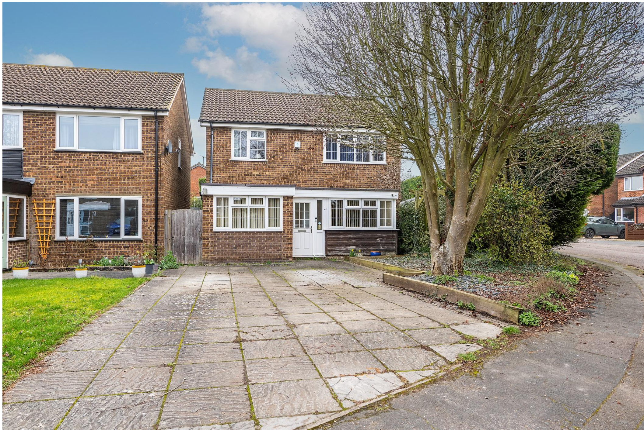
CRISPIN FIELD, PITSTONE, LU7 9BG