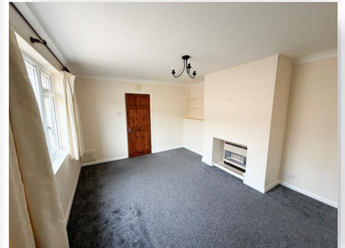
Millcroft, Soham, Ely CB7 5AP