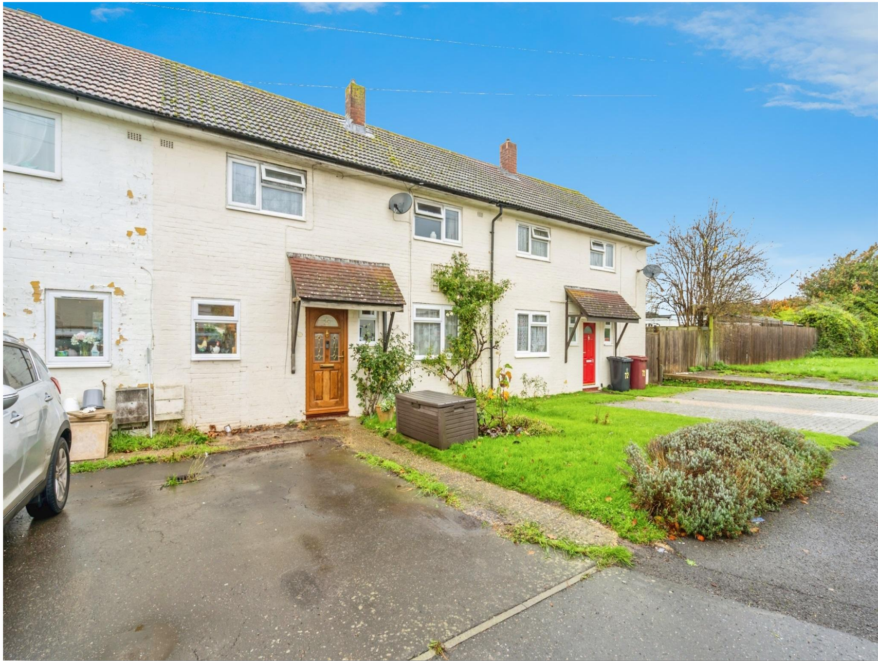
Cheshire Crescent, Tangmere CHICHESTER PO20 2HT