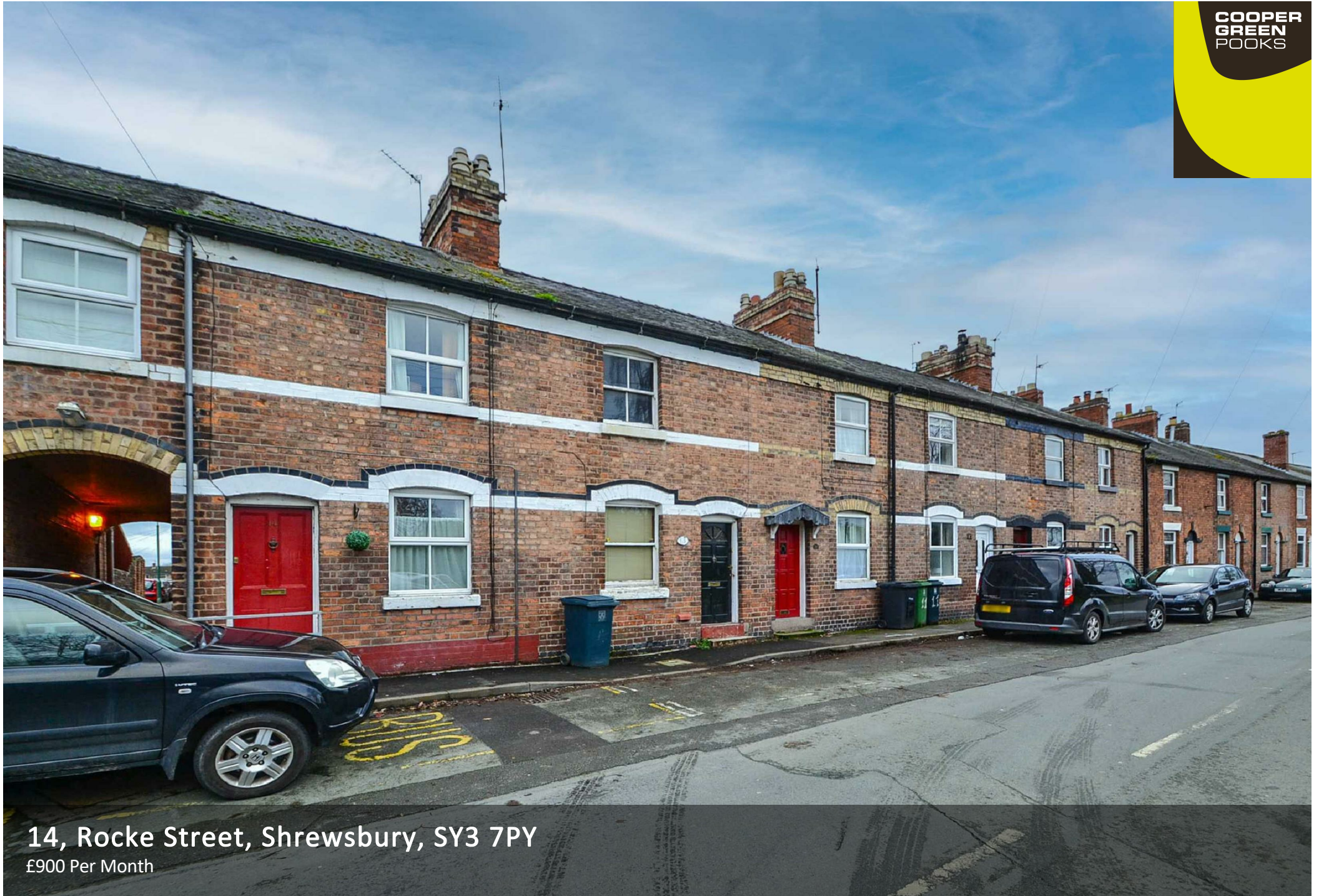
14, Rocke Street, Shrewsbury, SY3 7PY £900 Per Month