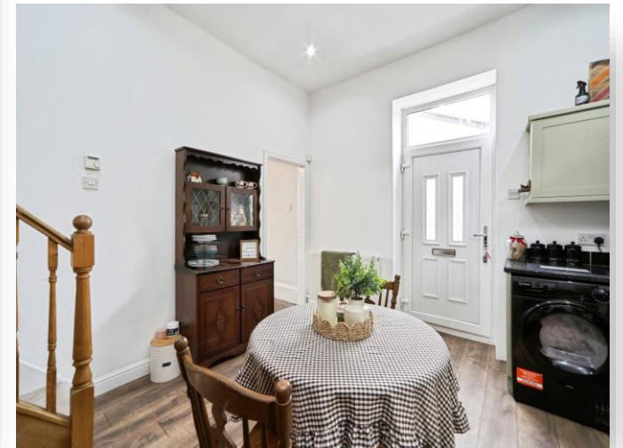
Owlet Road, Shipley BD18 2EN