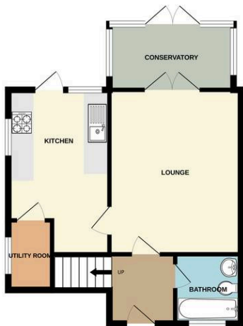
GROUND FLOOR 477 sq.ft. (44.3 sq.m.) approx.