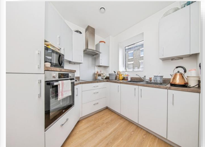
Thomas Wolsey Place, Lower Brook Street, Ipswich, IP4 1AL