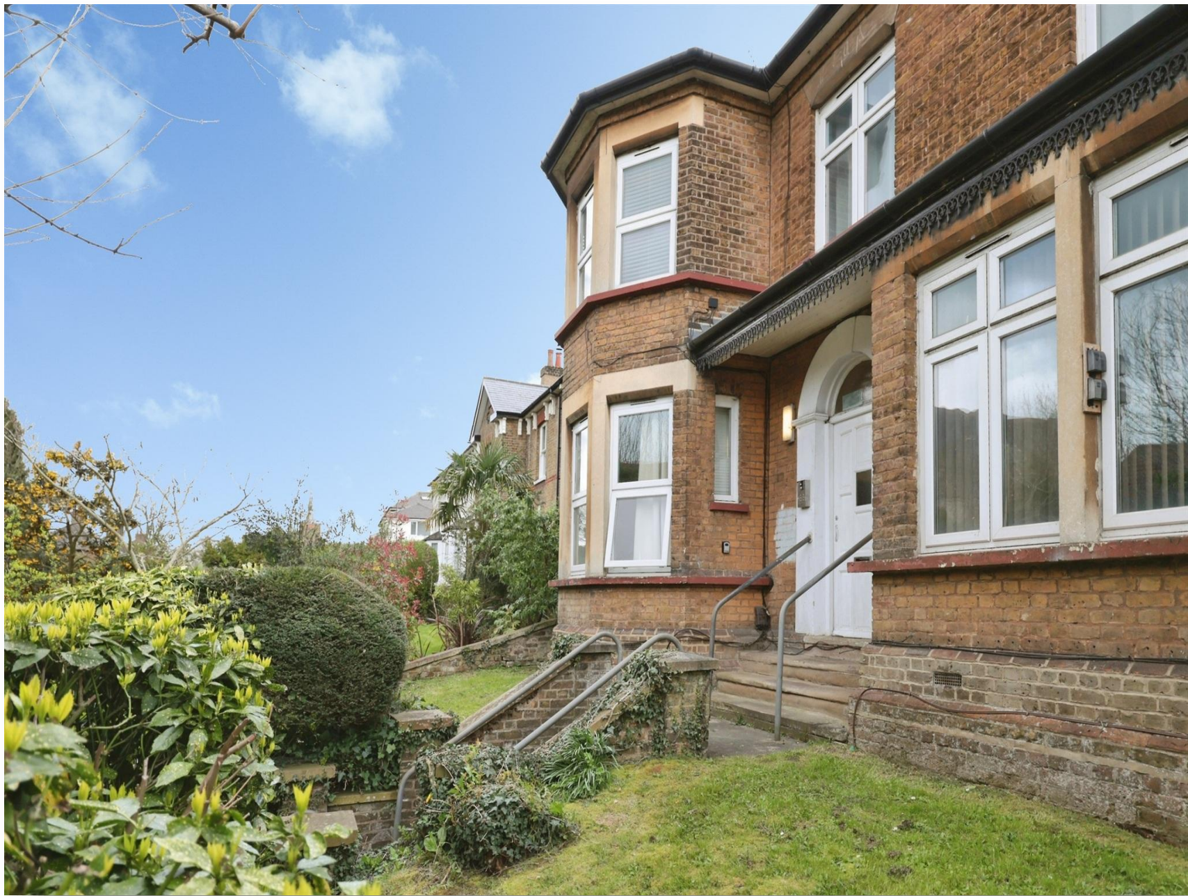
Chalk Hill, Watford, WD19 4BU