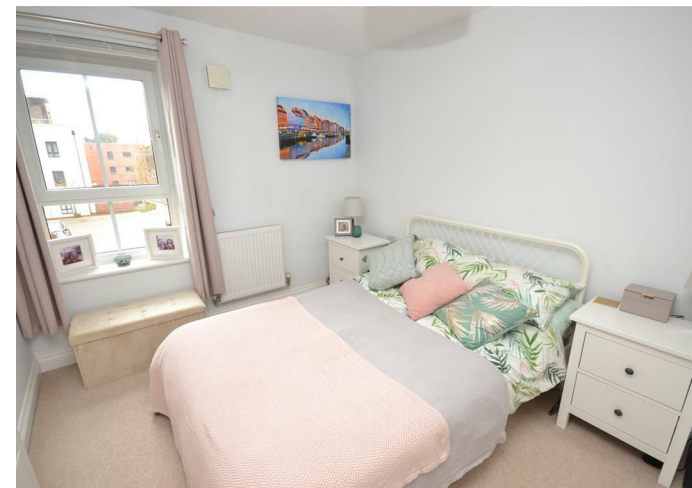
2 BEDROOM 1ST FLOOR APARTMENT

Whilst every attempt has been made to ensure the accuracy of the information contained herein, measurements of doors, windows, rooms and any other items are for information only and are not intended for use as a basis for any decision or mis-statement. This plan is for information only and is not intended for use as a basis for any decision or mis-statement. The services, systems and appliances are shown as they are at the time of the visit and no guarantee is made.