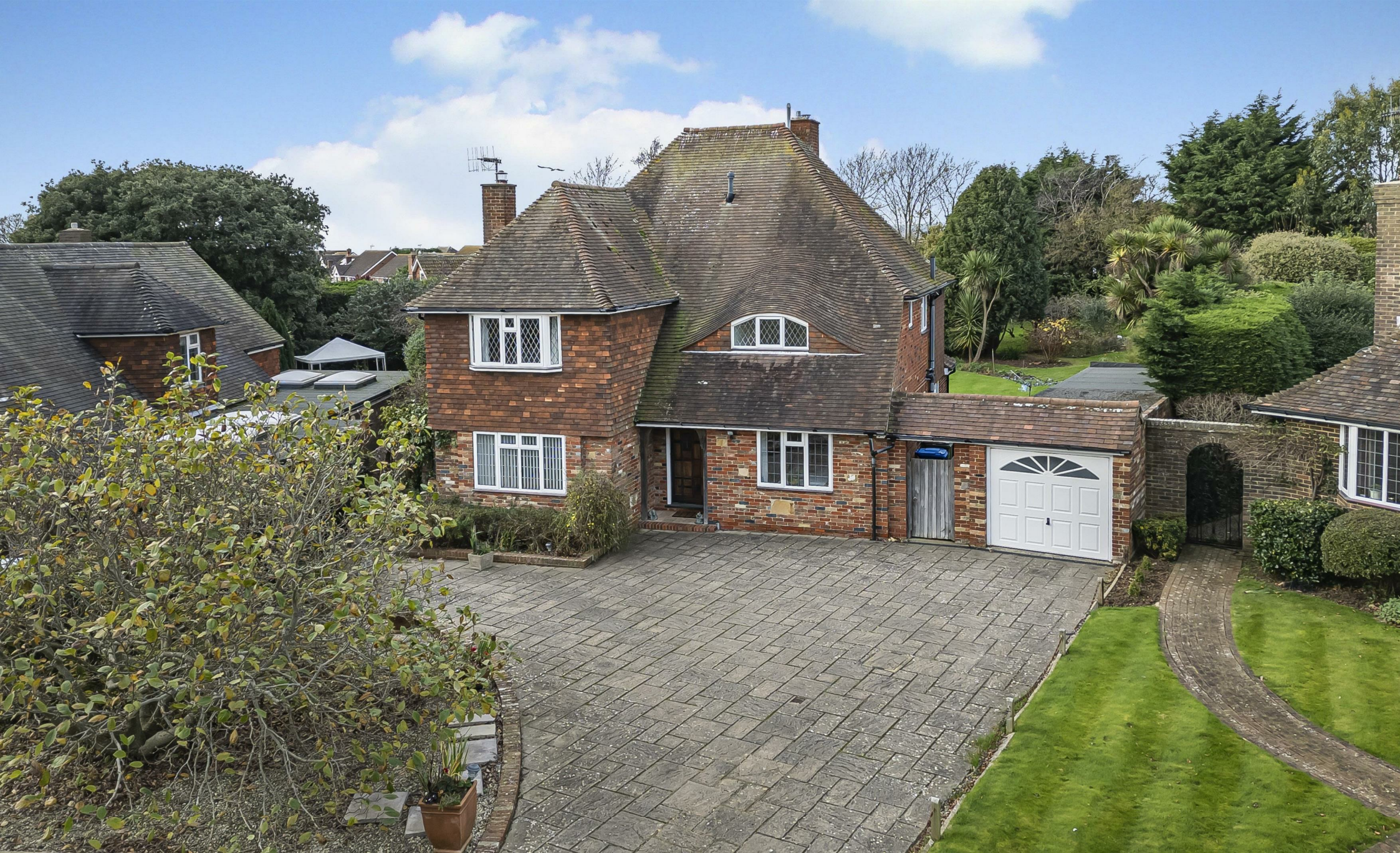
11 Firle Close, Seaford, BN25 2HL