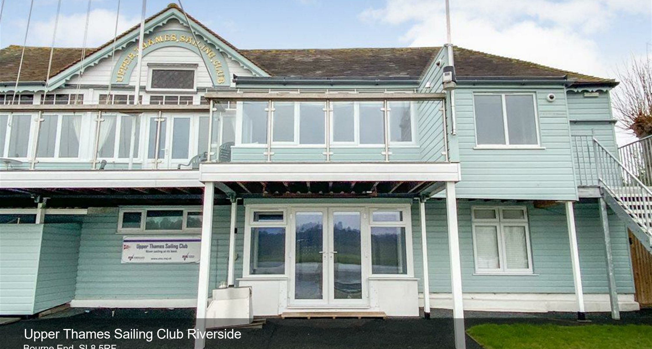
Upper Thames Sailing Club Riverside Bourne End, SL8 5RF