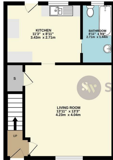
GROUND FLOOR 364 sq.ft. (33.8 sq.m.) approx.