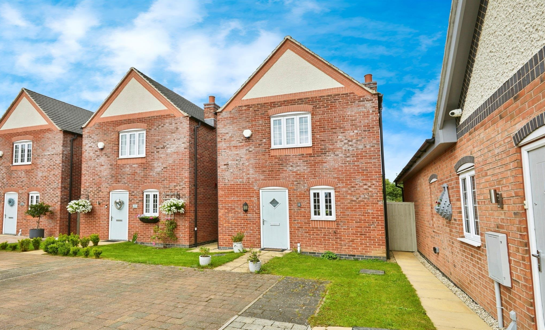
Bethany Close Willington Derby