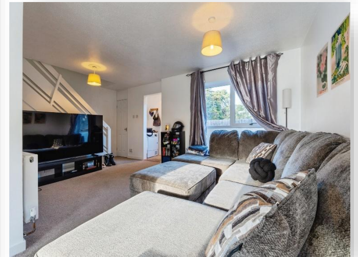
Lancewood Walk, RAF Lakenheath, Brandon, IP27 9QU