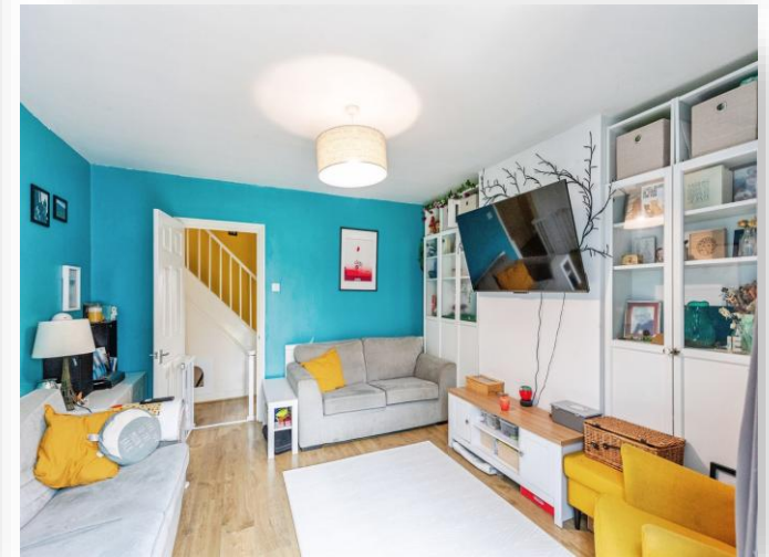
St. Andrews Crescent, WELLINGBOROUGH NN8 2EU