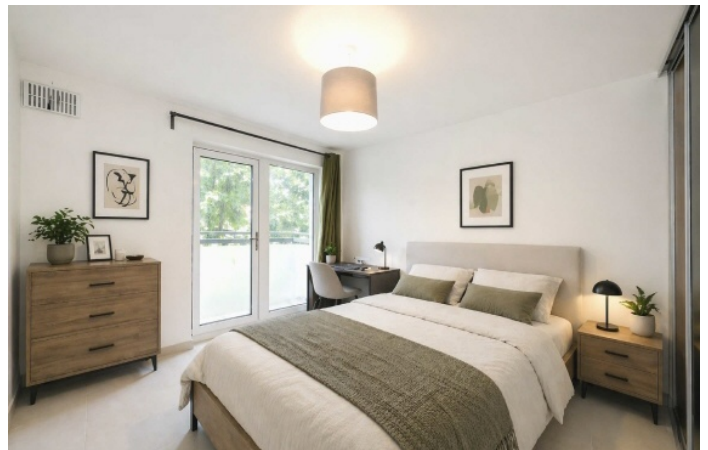
Coulgate Street, SE4