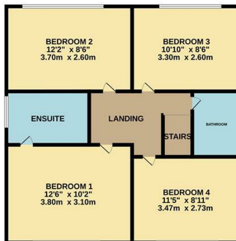
1ST FLOOR 607 sq.ft. (56.4 sq.m.) approx.