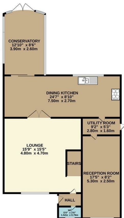
GROUND FLOOR 794 sq.ft. (73.8 sq.m.) approx.