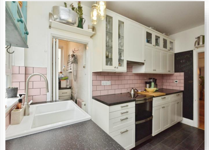
Frankston Avenue, Stony Stratford Milton Keynes MK11 1DR