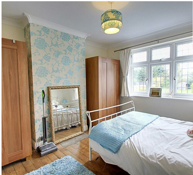
A spacious and flexible family home situated on the ever-popular Toms Lane.