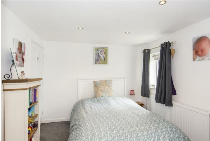
Bedroom One 9'7" x 14'11" (2.92m x 4.55m)

This double bedroom has dual aspect windows and a radiator. There is ample room for wardrobes and bedroom furniture. A door opens into the en-suite,