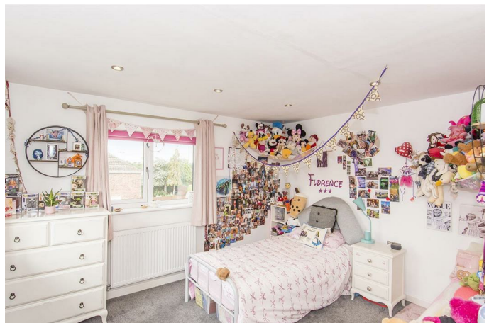
Bedroom Two 15'10" x 12'11" (max) (4.83m x 3.94m (max))

A double bedroom with three windows to both the front and side aspects. (This was originally two separate bedrooms but is now being used as one larger bedroom, however this can easily be converted back. )