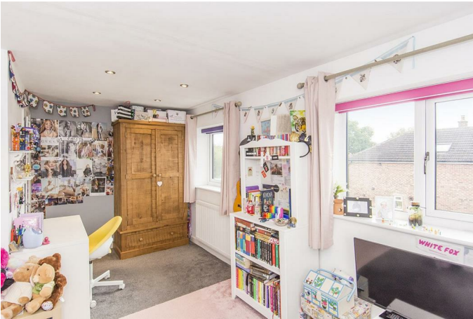
Bedroom Two Photo Three