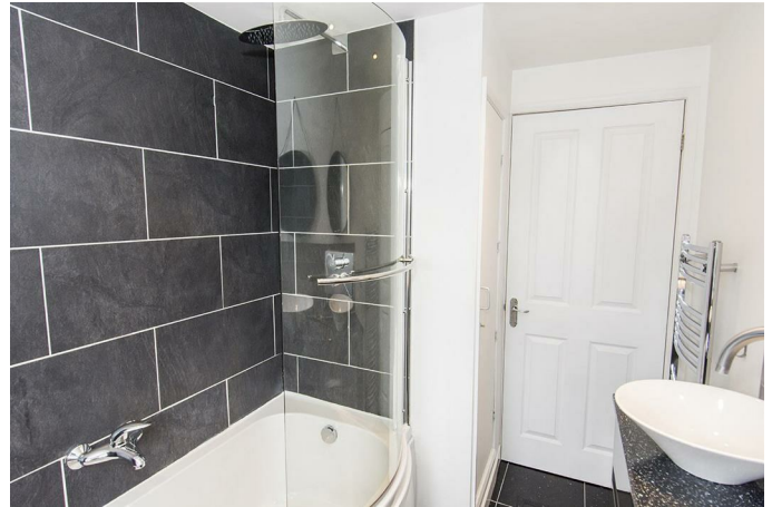
Bathroom Photo Two

The bathroom is fitted with a low-level WC and two circular wash hand basins set onto a bespoke drawer unit with mixer taps over. The bath has a shower over and is fitted side screen. Ceramic wall and floor tiling. There is an opaque window to the rear aspect. Chrome heated towel rail. There is also a cupboard that houses the gas central heating boiler.