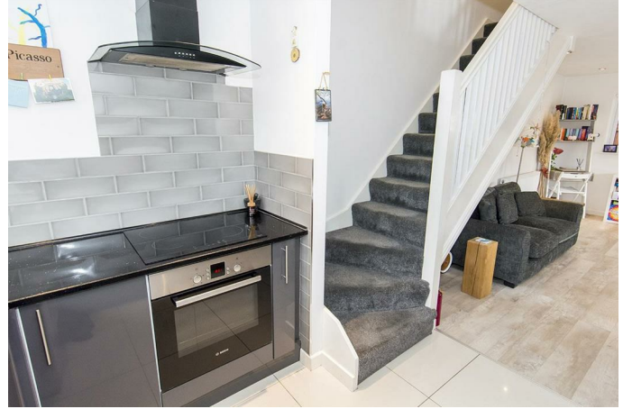
Kitchen Photo Two