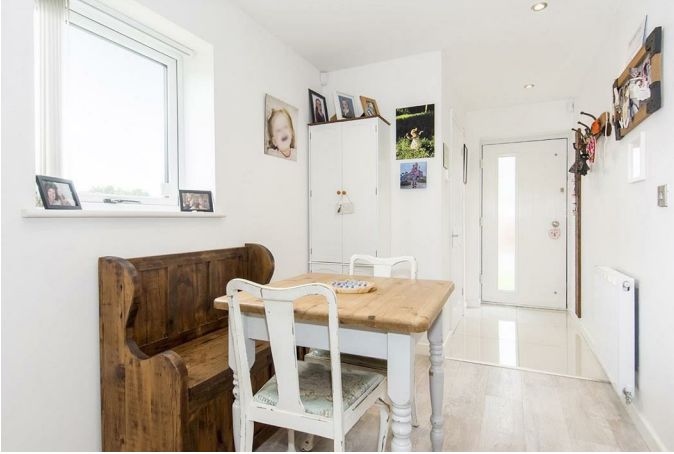
Dining Area Photo