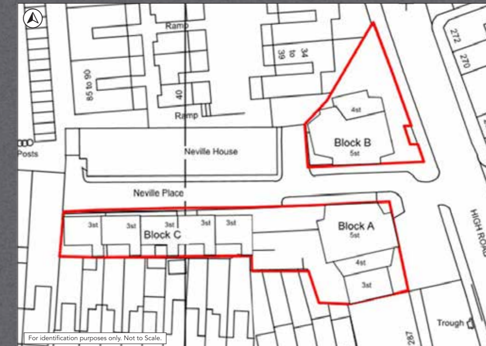
For identification purposes only. Not to Scale.