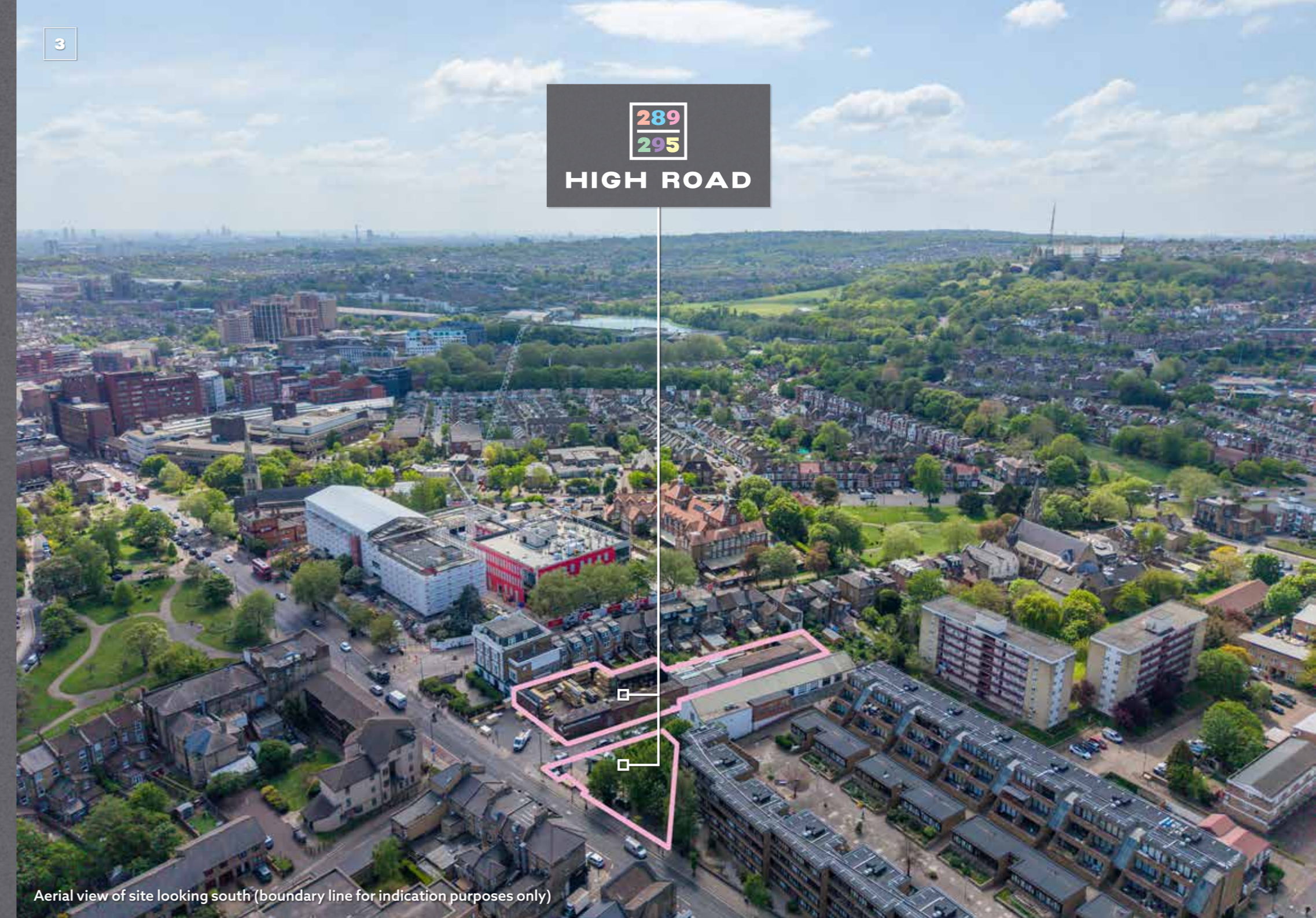
Aerial view of site looking south (boundary line for indication purposes only)

These particulars are intended only as a guide and must not be relied upon as statements of fact. Your attention is drawn to the Important Notice on the last page of this brochure.