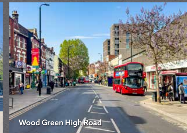
Wood Green High Road