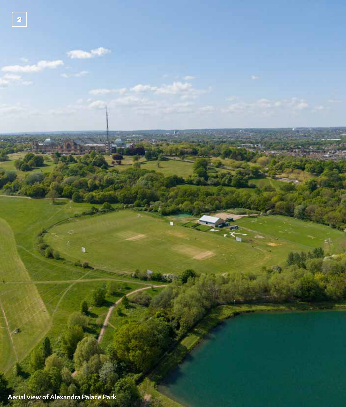
Aerial view of Alexandra Palace Park