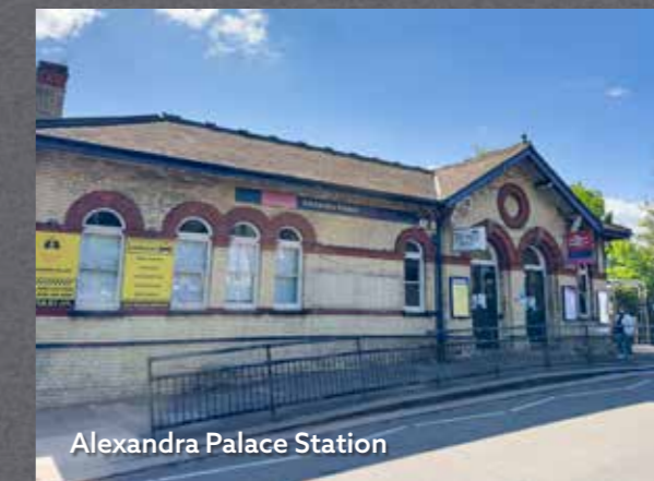
Alexandra Palace Station

For identification purposes only. Not to Scale.