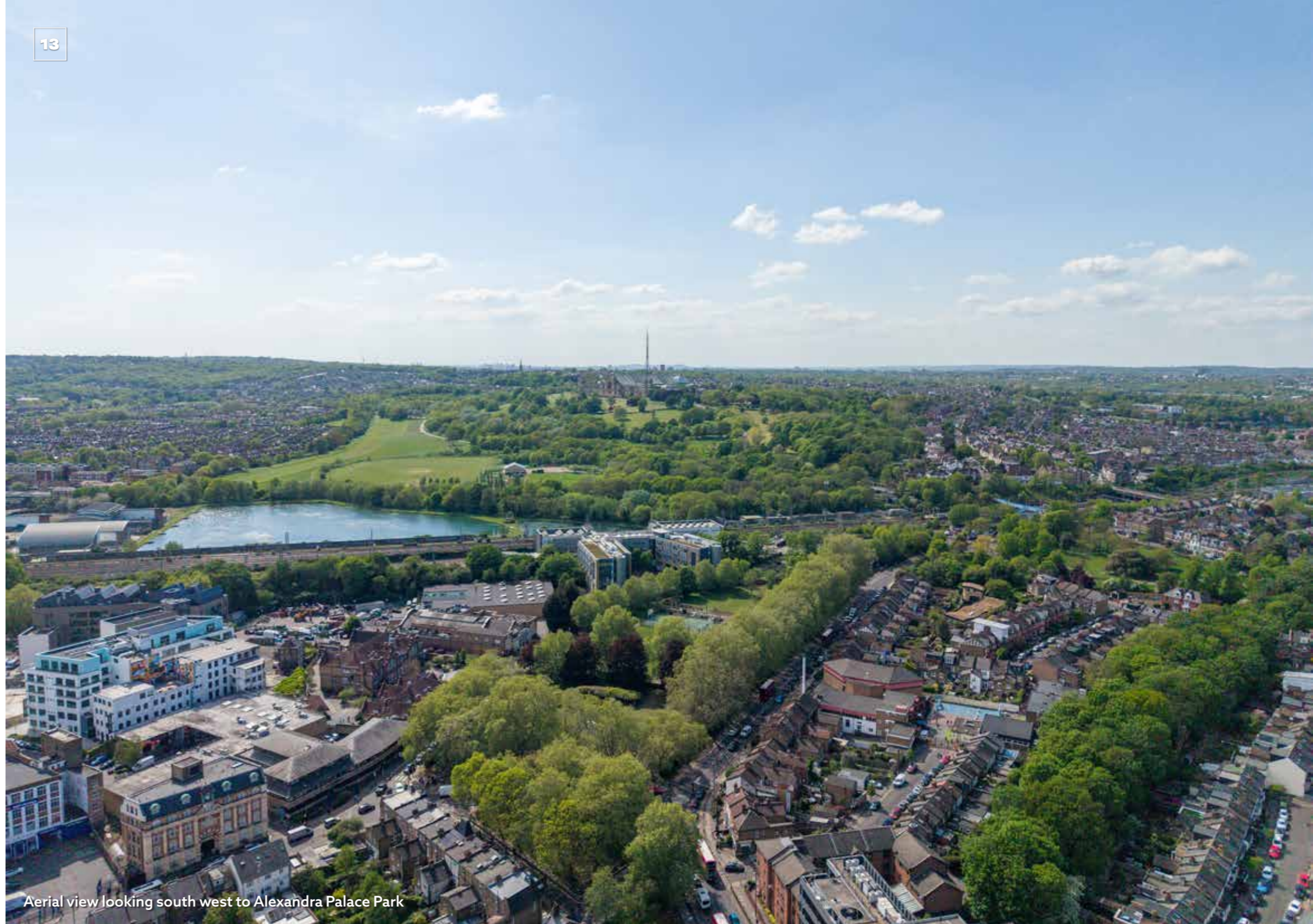
Aerial view looking south west to Alexandra Palace Park