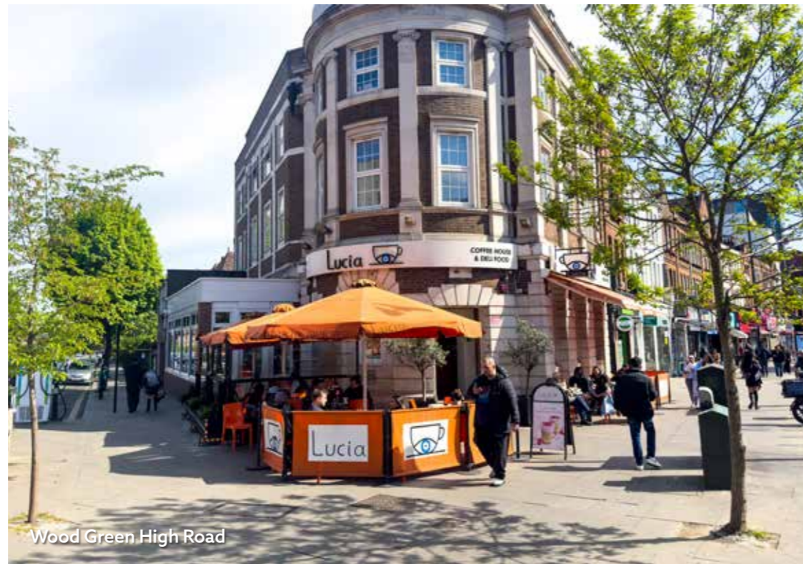
Wood Green High Road