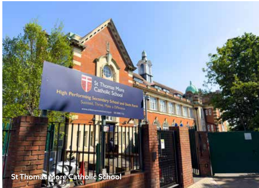
St Thomas More Catholic School

Overall, Wood Green offers a balanced town-centre setting, combining everyday amenities, established neighbourhoods and access to a range of open spaces.