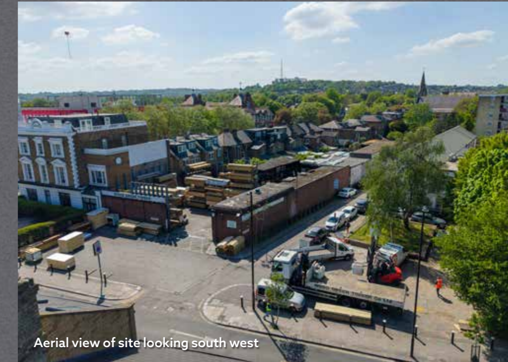
Aerial view of site looking south west

Please contact Knight Frank for data room access.