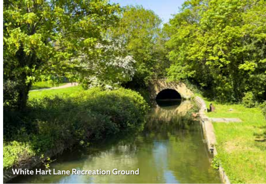
White Hart Lane Recreation Ground

In the surrounding compass point quadrants, the highest average prices (£848,373) were found to the west, while the most affordable (£511,740) were found to the east. The average price achieved within 1 km of the subject site was £523,232. When just flats are considered, the highest average prices (£537,043) were found to the south, while the most affordable (£390,423) were found to the north. The average flat sold within 1 km of the subject site achieved £523,232.