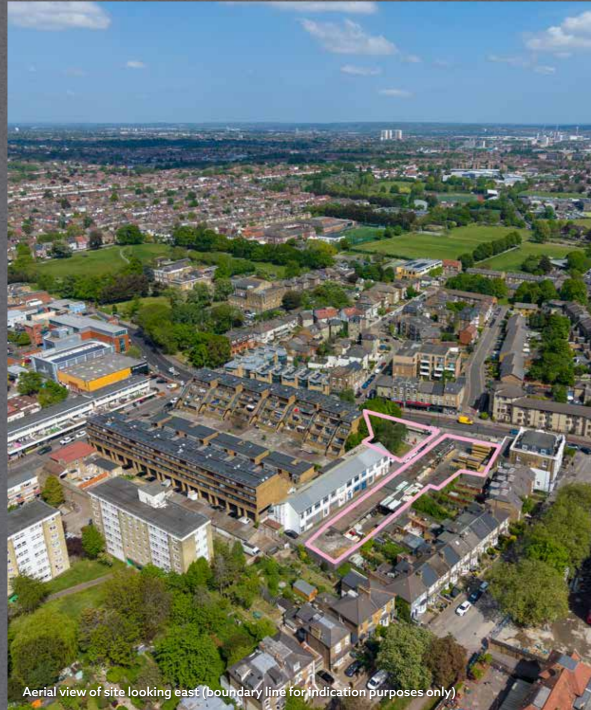
Aerial view of site looking east (boundary line for indication purposes only)